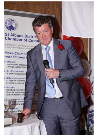
Mr Geoff Shreeves from Sky Sports TV