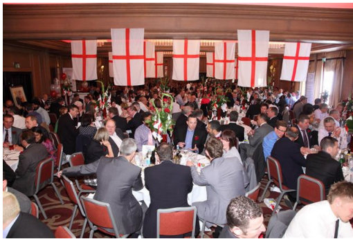
Room View, St George's Day Lunch at Sopwell House Hotel