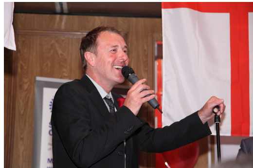
Mr Phil Tufnell